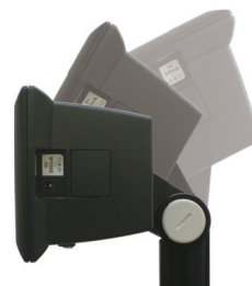
Tilting indicator bracket