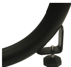
Additional pole-support foot