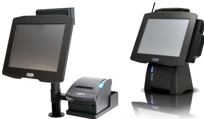
Various mounting ability for versatility and convenience

Providing Superior User Safety and Peace of Mind.