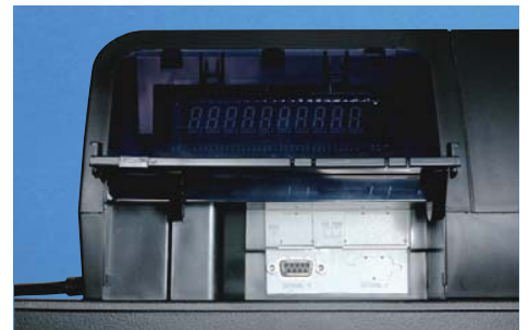
One Optimal RS-232C Port Hidden Behind a Convenient, Easy to Access Door